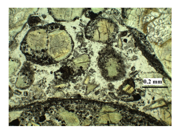
Fig. 2. Gritty kimberlite characterised by globular segregations set in an inter-globular matrix mainly of 'serpentine' and lesser calcite.

The Gritty kimberlite is a highly irregular body, as indicated by drilling, and is intrusive into the core of the Fragmental kimberlite. The most striking feature of this rock is the presence of numerous spherical to elliptical, globular structures of kimberlite (Fig.2). These range in size from <0.1 mm to > 18 mm. In most cases, these structures contain kernels of country rock xenoliths and/or olivine macrocrysts surrounded by variably sized mantles of finer-grained kimberlite. This consists mainly of small olivine phenocrysts set in a much groundmass. This finer-grained groundmass consists of relicts of very fine-grained, granular, serpentinized monticellite, very fine phlogopite and evenly-distributed, euhedral, opaque spinels (<0,07 mm) and perovskite (up to 0.2 mm) all set in a base of 'serpentine'. In all cases much of the fine groundmass, particularly the serpentinized monticellite, is replaced by microlitic diopside. All olivine grains are contained within the globules but many xenoliths occur outside of globules. In most specimens, relicts of fresh olivine occur. Olivine