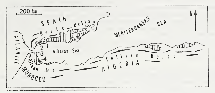
Figure 1. Ultramafic/granulitic associations in the Betico-Rifean belt; southern Spain: 1 - Ronda, 2 - Ojen; Northern Morocco : 3 - Ceuta, 4 - Beni Bousera (Kornprobst and Vielzeuf, 1984).

This layered peridotite and garnet pyroxenite complex and associated thermally metamorphosed gneisses, together with others, notably the Ronda complex, form part of the Betico-Rifean orogenic belt in the western Mediterranean (Kornprobst and Vielzeuf, 1984, and references therein) (Fig. 1).