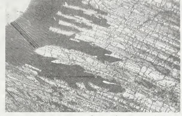
Fig.1. Curved plates of orthopyroxene(light) and clinopyroxene(grey) in laminar crystal.Garnet(black) remplaces orthopyroxene.X nicols,magn.30.

postmetamorphic magmatites, basically, on the grounds of weak or no recrystallization evidence under stress conditions. Garnet lherzolites of probable magmatic type from Udachnaya pipe differ from those of restite type in such parameters as enrichment of rocks by garnet and clinopyroxene, cumulative banding, composition heterogeneity, presence of paragenic phlogopite, more ferroginous composition of minerals, sulphide globules presenting, probably, former drops of sulphide liquid in siliceous one. High mag-