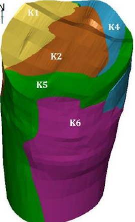
Figure 1. The different lithofacies of the Main Liqhobong Kimberlite Pipe. The pipe's surface diameter is ~300m.

K1, a tuffisic kimberlite breccia (TKB) which comprises approximately ~3% of the indicated resources (to -180m) was exposed during the current mining activity in the NW quadrant of the Pipe. The K1 lithofacies forms a shallow wedge striking NE (Fig. 1), and is recognised by its clayey texture with distinctive highly altered brown basalt and basement xenoliths, moderately abundant olivine macrocrysts, copious carbonate veining and infrequent pelletal lapilli.